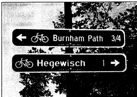
Example of directional signs from Chicago