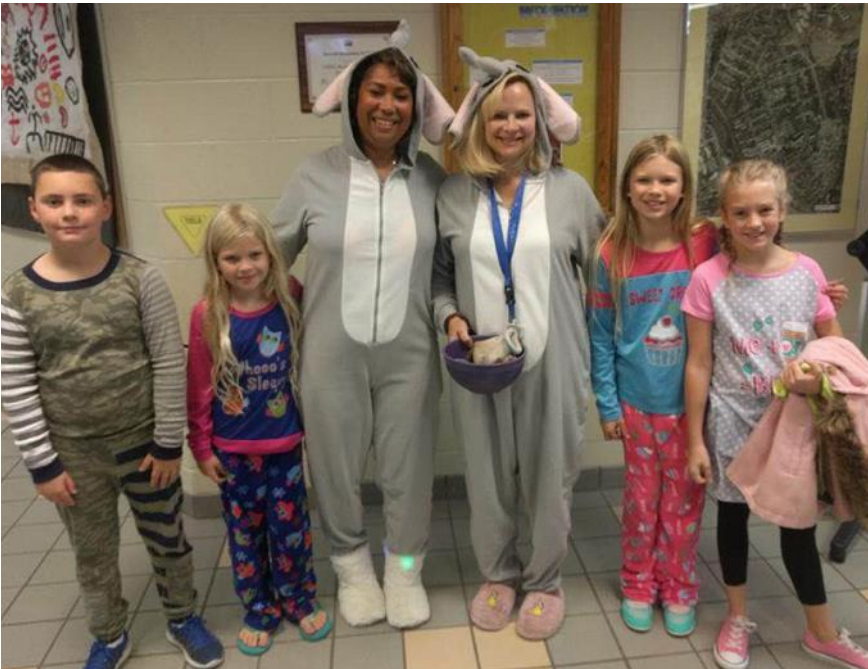
Students and staff all enjoyed pajama day on October 28.