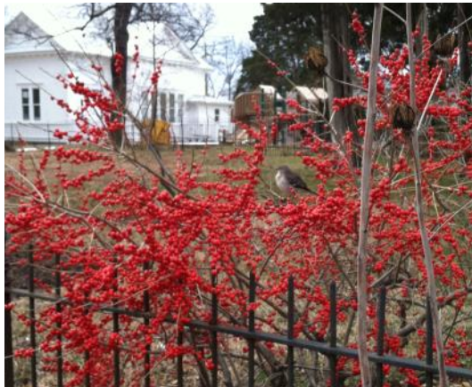
Winterberry Holly at the Glencarlyn Library Community Garden with a Mockingbird.

Winter Honey-suckle ( Lonicera fragrantissima ) – This shrub looks nothing like the more vining members of its family, nor is it a great beauty to behold. However, its ivory white flowers have a deli-