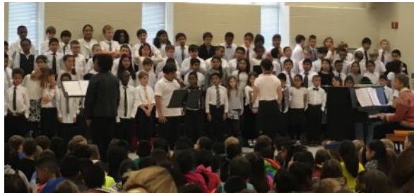
Barcroft 4th and 5th grade choirs.

December has been a really busy month, with the Scholastic Book Fair, Leo Day and Leo Night, Hour of Code, field trips and music concerts. Leo Night is always a favorite as the students are the teachers and teach their families about what they have been studying over the past quarter. The music department hosted an amazing concert on Decem-