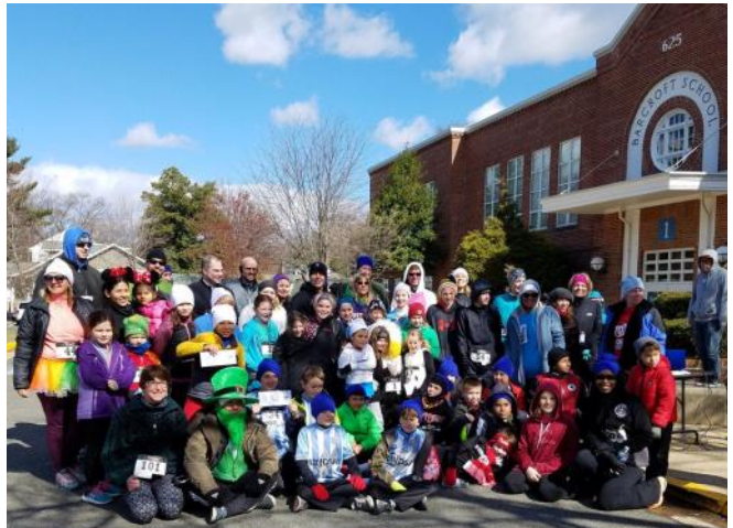
Participants in the Snowball Stride held March 11.

classes to strengthen and extend learning for Barcroft students. The program provides alternative instruction using a thematic, project-based approach filled with hands-on learning to enrich the experience for students. The