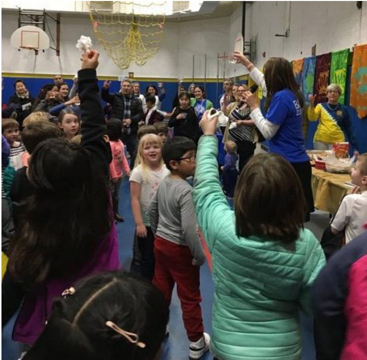
Barcroft Elementary students offer a sparkling water toast at Author's Night.

Barcroft Elementary has had lots of fun activities to counteract the dreary, cold winter! We enjoyed Spirit Week at the end of January, with pajama day and the ever-popular crazy hair day among the themes.