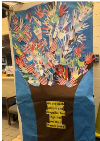
Scenes from International Night on May 9.

parents and local businesses, and each other's company at the Barcroft Community House. We hope to make this an annual event, and all are welcome.