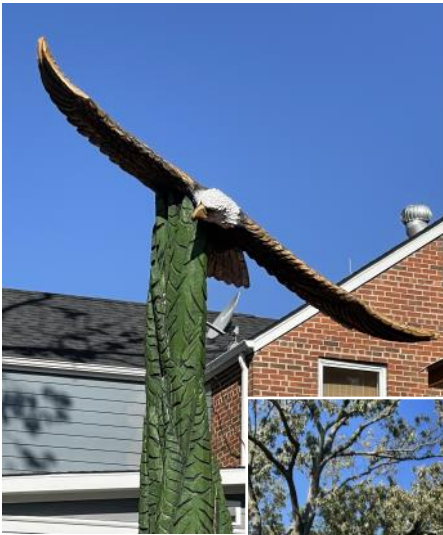
Dead trees take on new life on South Pershing Drive (above) and 4th Street, South (right).

Concrete “Art Deco” Fence: General-ly, one doesn’t associate a concrete fence