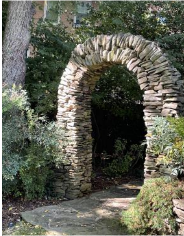
Garden arch at First Road South.

front porch always seems an invitation to sit and chat, but the painted sky and fluffy clouds invite deeper relaxation at this house on the corner of Wakefield and 6th Street South. The skyscape on the front porch ceiling also seems to extend the beautiful garden that surrounds this house right up to the front door.