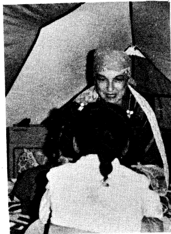
PHOTOS FROM LAST MONTH'S BARCROFT SCHOOL CARNIVAL